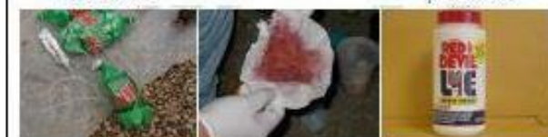
Any containers with plastic tubing or hoses