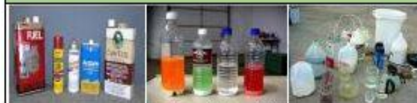
Flammable solvent containers in large quantities or with other waste