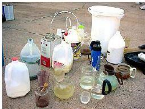
Common items used in the production of Meth