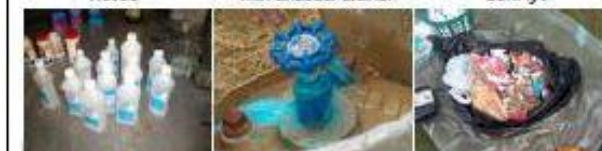
Crystal Drano, iodine, hydrogen peroxide, isopropyl alcohol